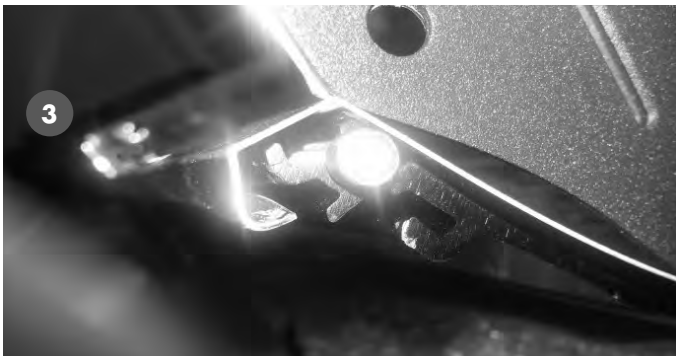
Pry end of reflector open