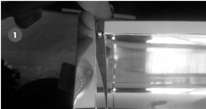
Bend open side to unlock