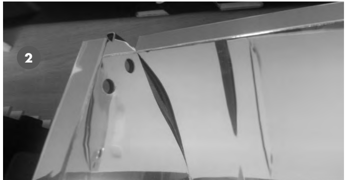
Open reflector all the way